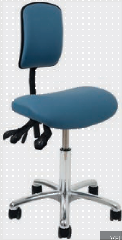
VELA Samba 150