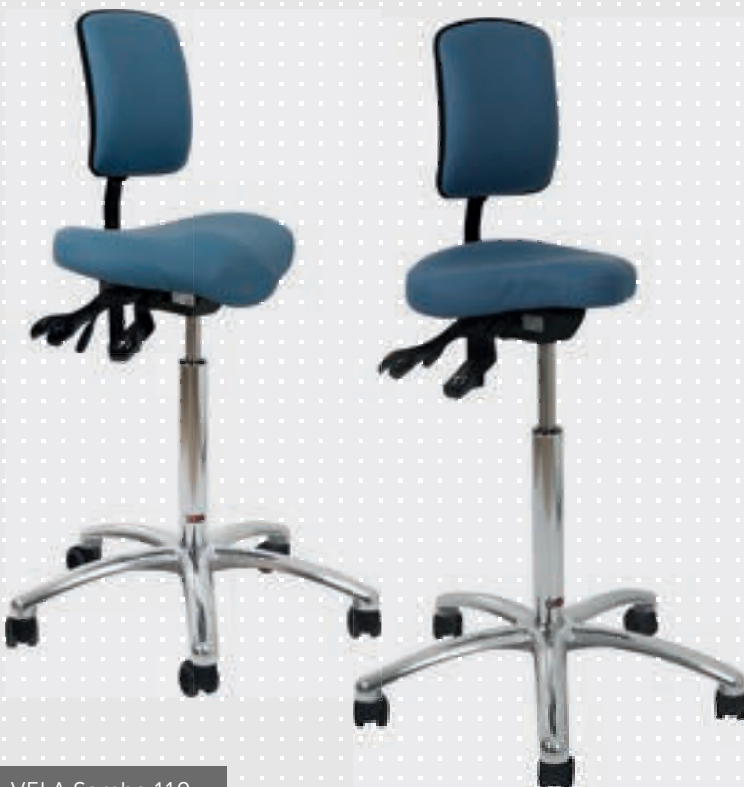
VELA Samba 110