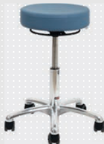
VELA Samba 500