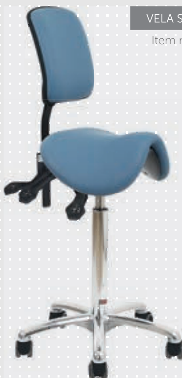
VELA Samba 420