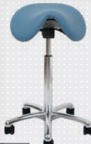
VELA Samba 400